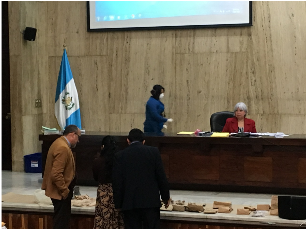
Figure 7: Defense lawyers examine the forensic evidence.

disintegrated over time. 55 The court called upon the FAFG to present the forensic evidence in