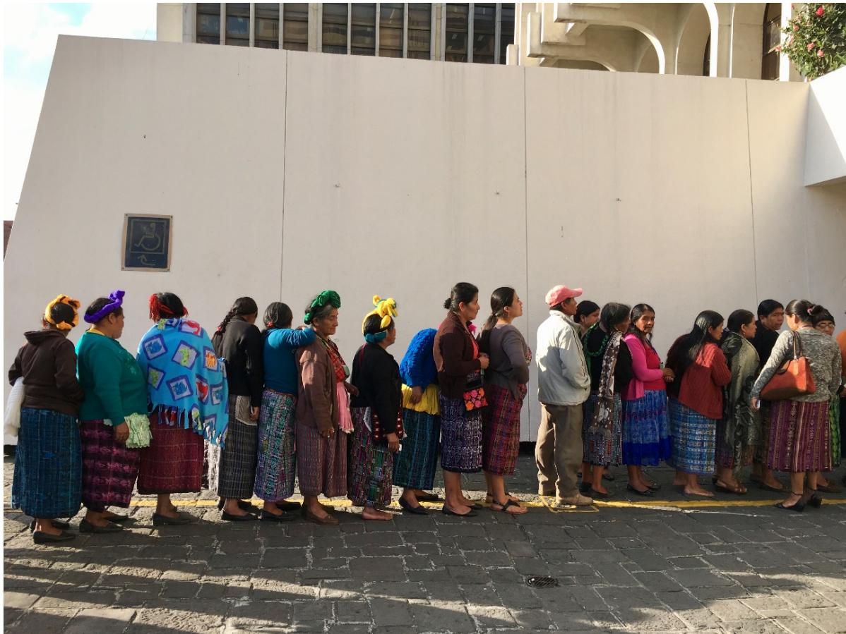
Figure 3: Women-survivors of sexual violence from other regions wait outside the courtroom building to attend the Sepur Zarco trial in solidarity.

courtroom, veiled in their iconic shawls, the crowd burst into applause and began chanting, “Justice, justice!” and “We are all Sepur Zarco!”