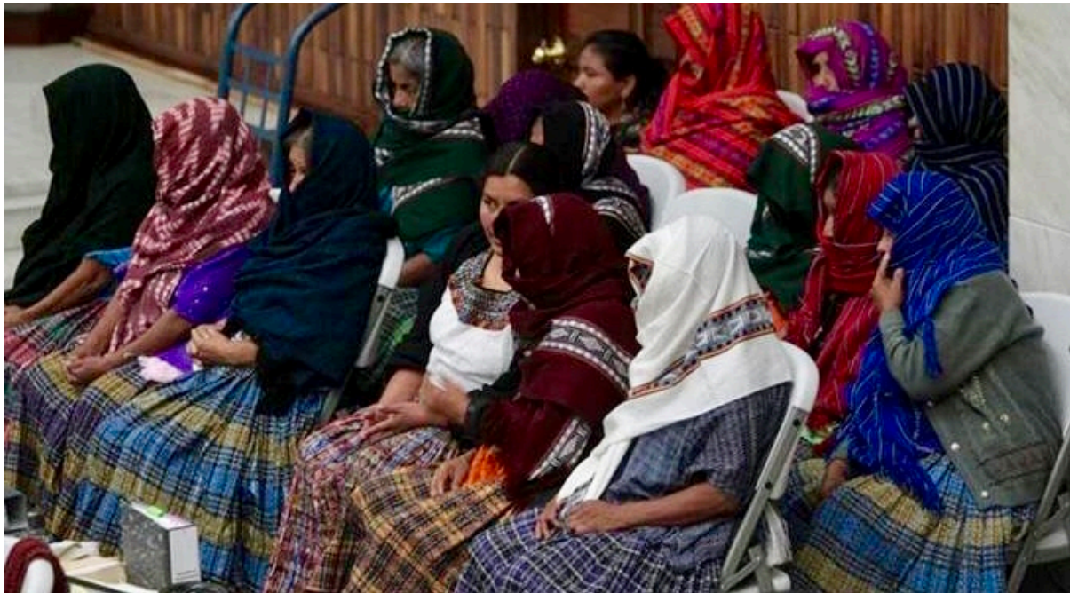
Figure 5: The Grandmothers of Sepur Zarco with their translator.