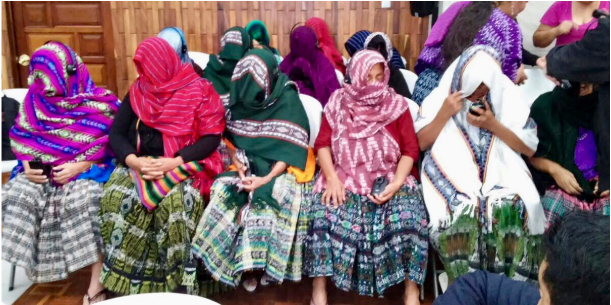
Figure 11: The Grandmothers of Sepur Zarco.

deserving of rights, a category previously denied to them.