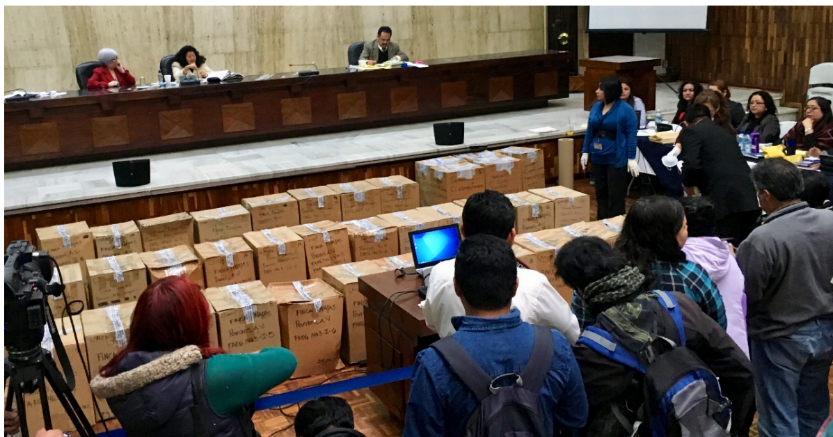
Figure 6: Forensic evidence. Boxes containing the remains of those exhumed from the Tinajas military base were laid out in court on February 11, 2016.

post-mortem data, interviews families of victims, and employs a series of scientific methods decades to locate and identify individuals who were forcibly disappeared or are otherwise to identify mass graves, conduct exhumations, and uses DNA testing and other mechanisms to identify the bodies so that they can be returned to their families for burial. FAFG has a long-standing agreement with the Attorney General's Office of Guatemala to assist in the search for the missing and has exhumed more than 8,000 human remains.