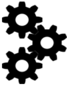
Research & learning from best practice

We welcome your ideas and, in particular, the following information: