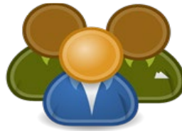
Experience and views