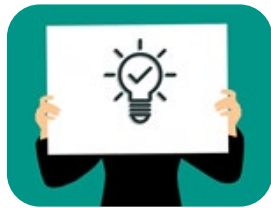
Practitioner knowledge and skills