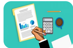
Data and statistics